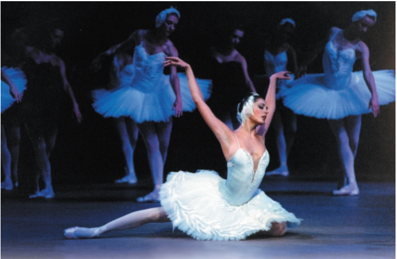
Mariinsky Ballet, St. Petersburg